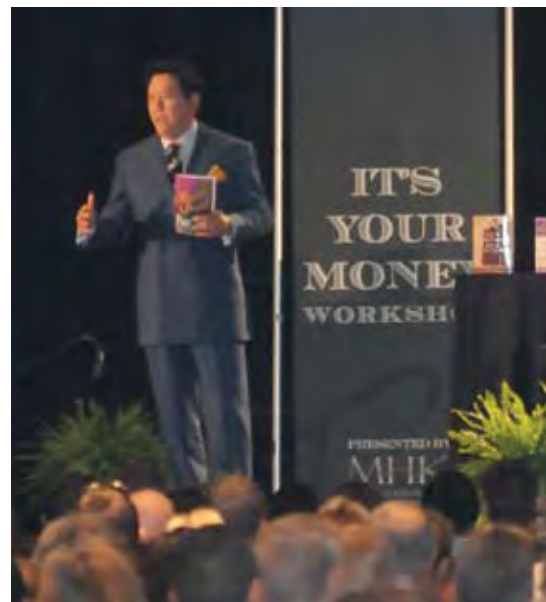
Kiyosaki in action

Robert Kiyosaki and his advisers appear live at Auckland's Logan Campbell Centre on Wednesday June 3.