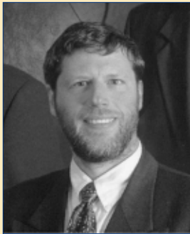
Rod Carr - Reserve Bank of New Zealand Deputy governor.